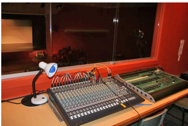
Sound and Lighting mixing desks – located in control room