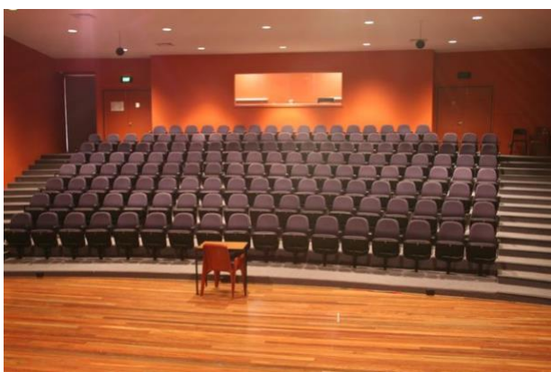
View of theatre from stage