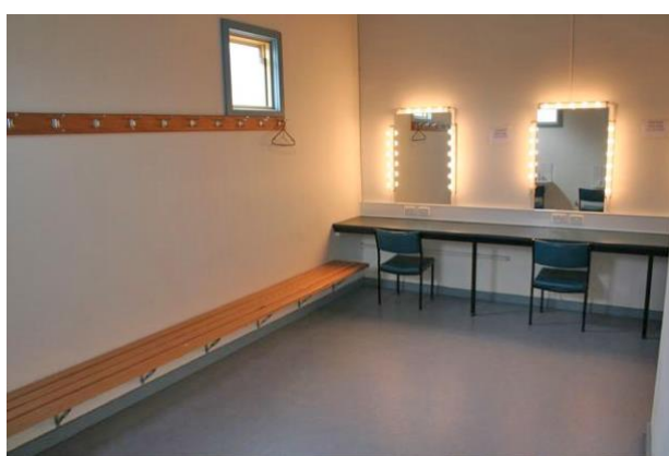
View of Dressing Room 2