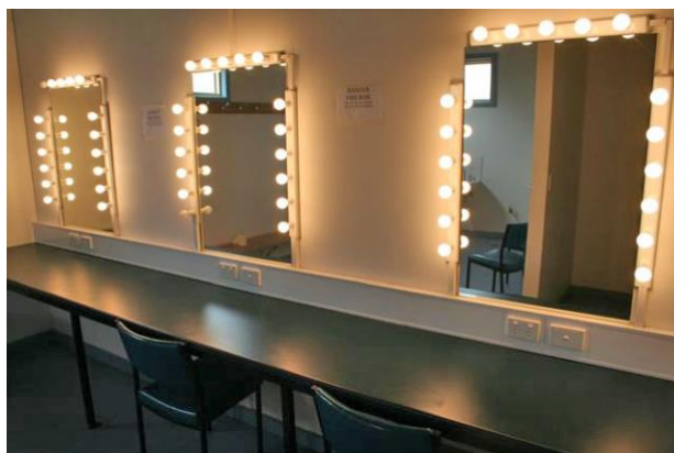
View of Dressing Room 1