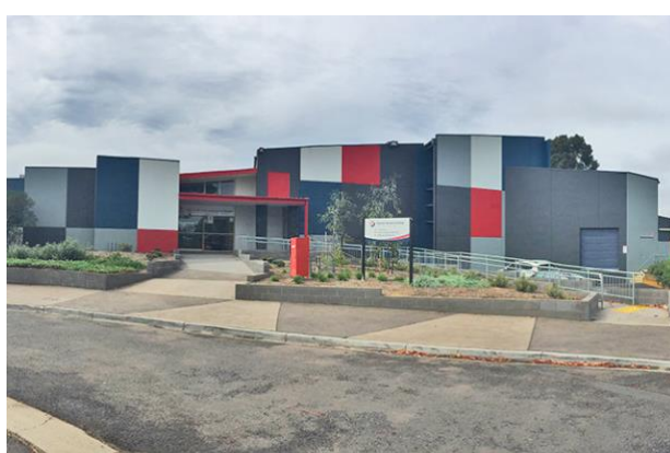
View from outside - main entrance