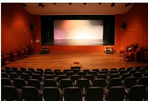
View from back of theatre