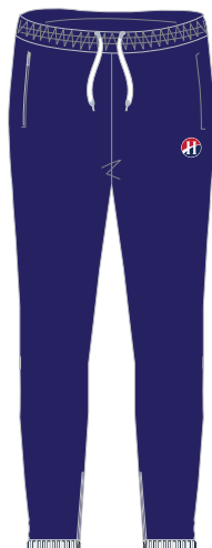
Trackpant Zip Legs