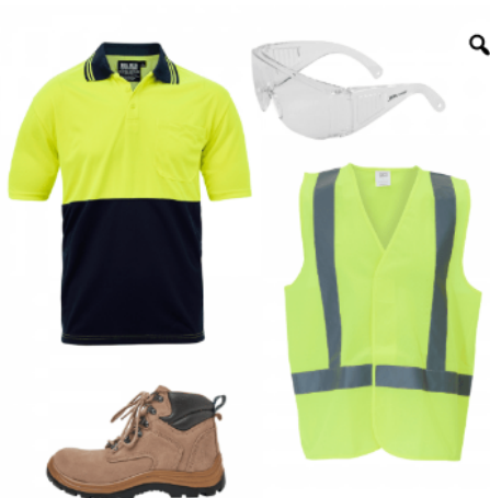
Building & Construction